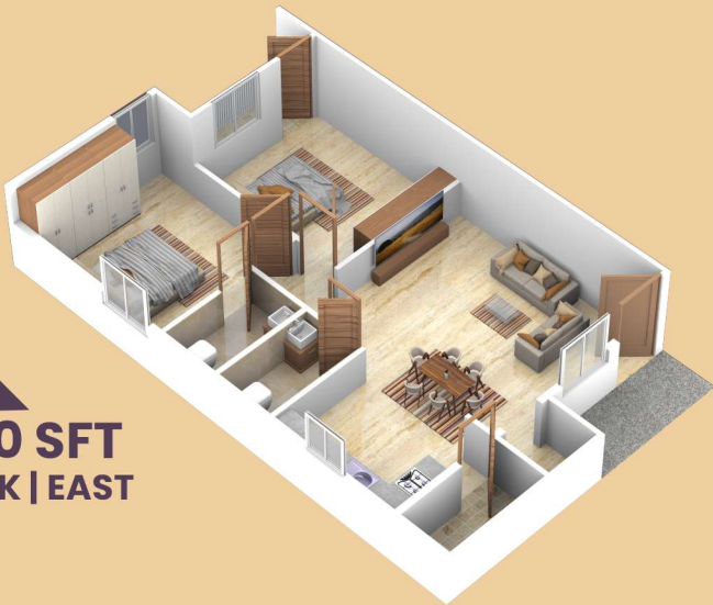
F: 02 1100 SFT 2 BHK | EAST