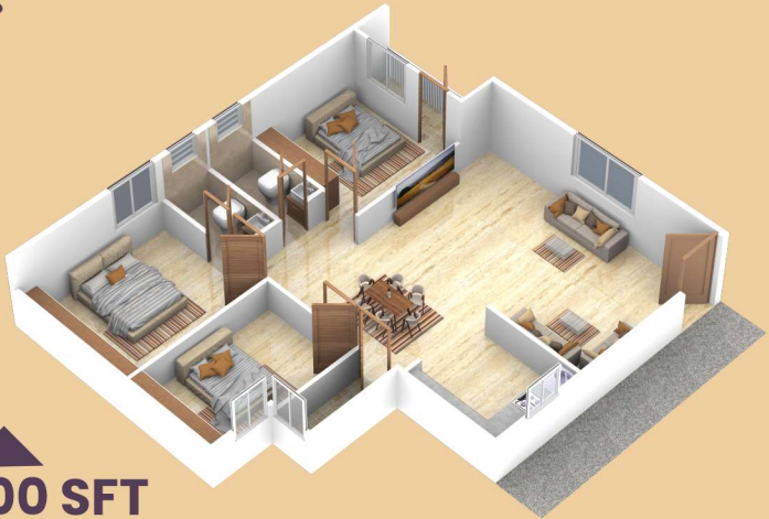
F: 01 1300 SFT 3 BHK | EAST