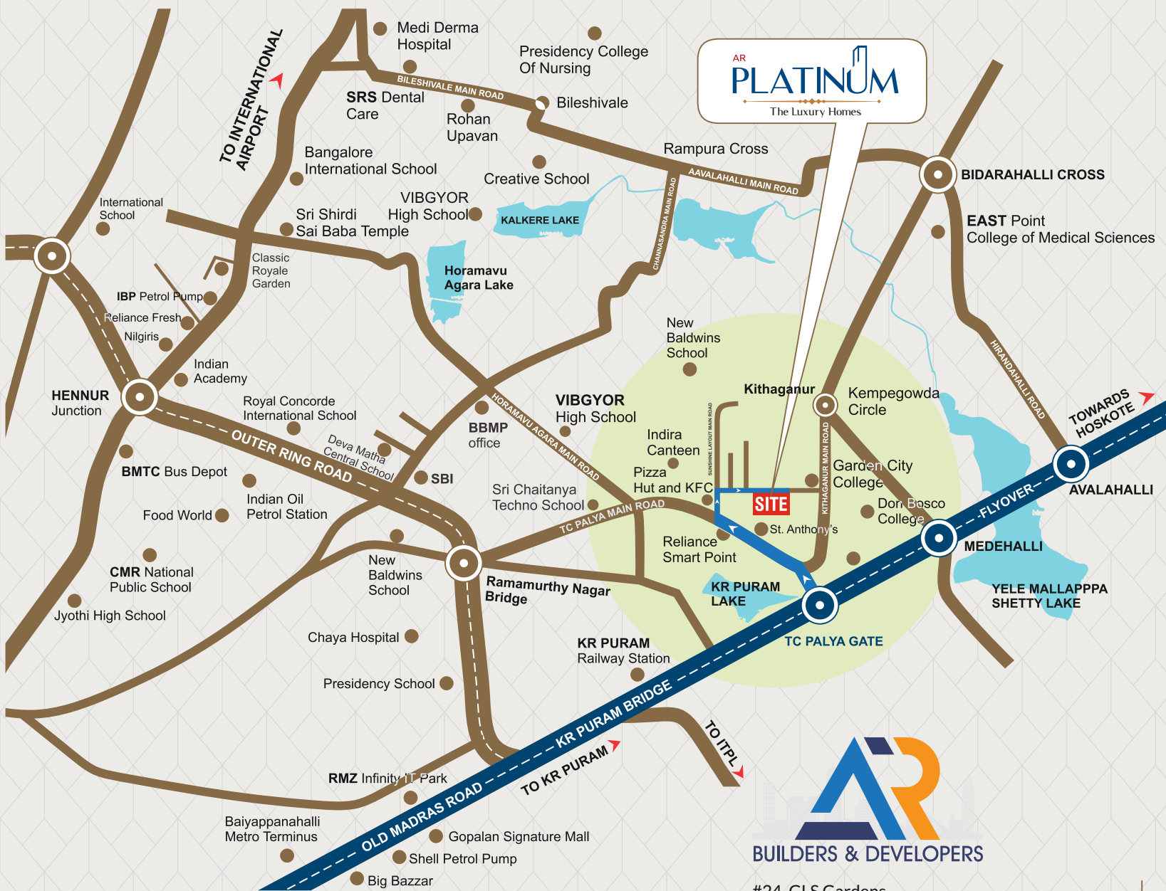
Location Map Not To Scale